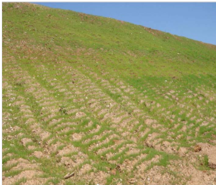
Figure 3: Result of experiment carried out in the field with Bermuda Grass

Based on these criteria and the proposed embankment geometry different options of grass, small size leguminous and some shrubs were assessed to form a 60-80% cover of the downstream slope with grass and 25% with shrubs. Field experiments in the area were carried out for 10 species and the ones presenting the best performance, Bermuda and Pensacola grass, were recommended for utilization at the closure stage (Figure 3).