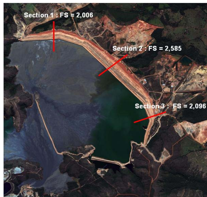
Figure 2: Sections of Analyses of Stability and safety factors found for the closure condition.