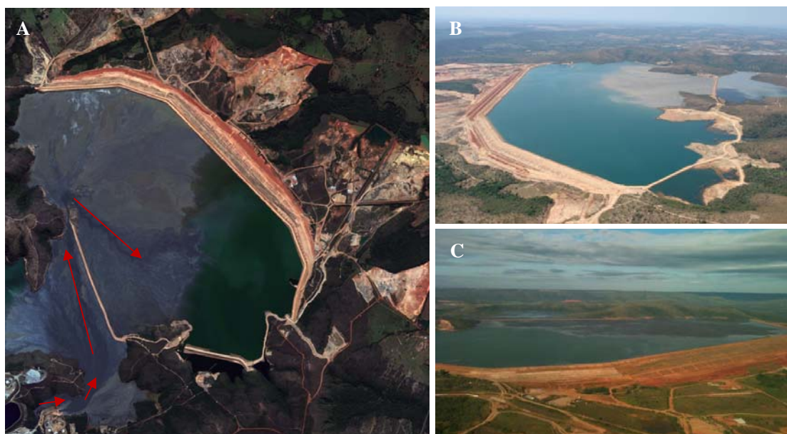
Figure 1. a) Tailings distribution in Santo Antônio Dam; b) View of Santo Antonio Dam in 2009; c) View of Santo Antônio Dam in 2014

Antônio Dam is 105m high, has a crest length of 5 km, contains 382 Mm 3 of deposited tailings and 9 Mm 3 of stored free water.