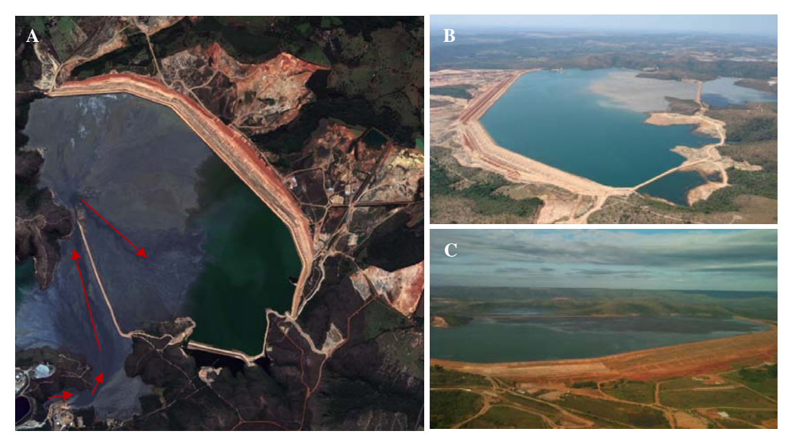
Figure 1. a) Tailings distribution in Santo Antônio Dam; b) View of Santo Antonio Dam in 2009; c) View of Santo Antônio Dam in 2014

Antônio Dam is 105m high, has a crest length of 5 km, contains 382 Mm<sup>3</sup> of deposited tailings and 9 Mm<sup>3</sup> of stored free water.