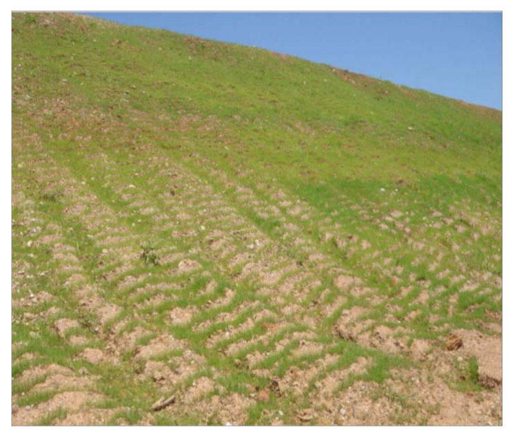
Figure 3: Result of experiment carried out in the field with Bermuda Grass

Based on these criteria and the proposed embankment geometry different options of grass, small size leguminous and some shrubs were assessed to form a 60-80% cover of the downstream slope with grass and 25% with shrubs. Field experiments in the area were carried out for 10 species and the ones presenting the best performance, Bermuda and Pensacola grass, were recommended for utilization at the closure stage (Figure 3).