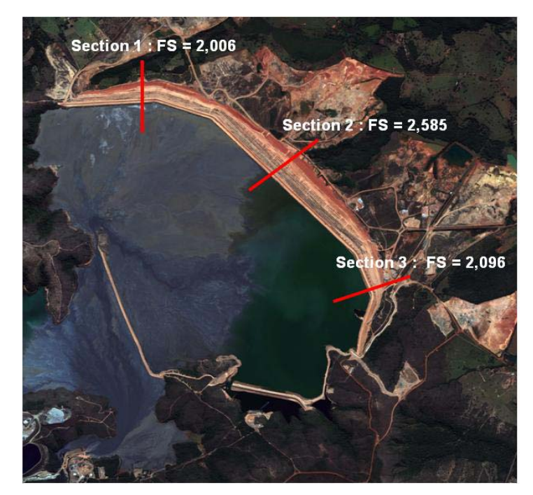
Figure 2: Sections of Analyses of Stability and safety factors found for the closure condition.

- Slope stability safety factors must be above 1.5 as required by Brazilian standards. The safety factors were assessed for three sections of the dam: right side abutment, central section and left side abutment. In all analyses carried out the values found were above the required by the Brazilian standards (See Figure 2);